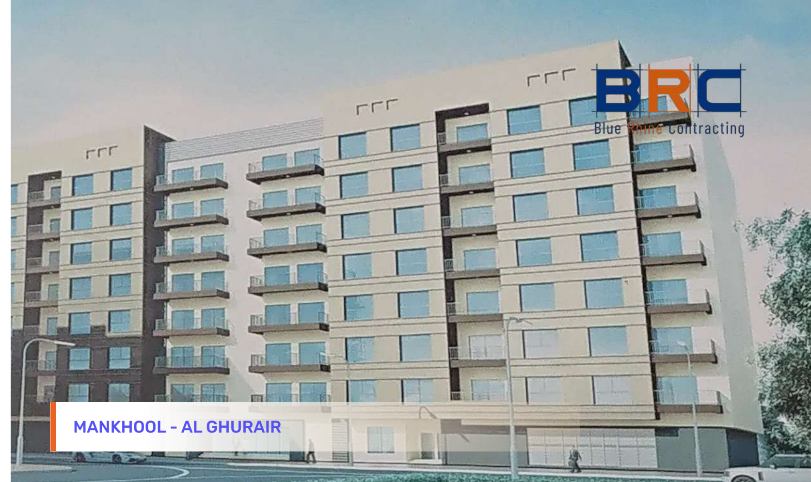
MANKHOOL - AL GHURAIR