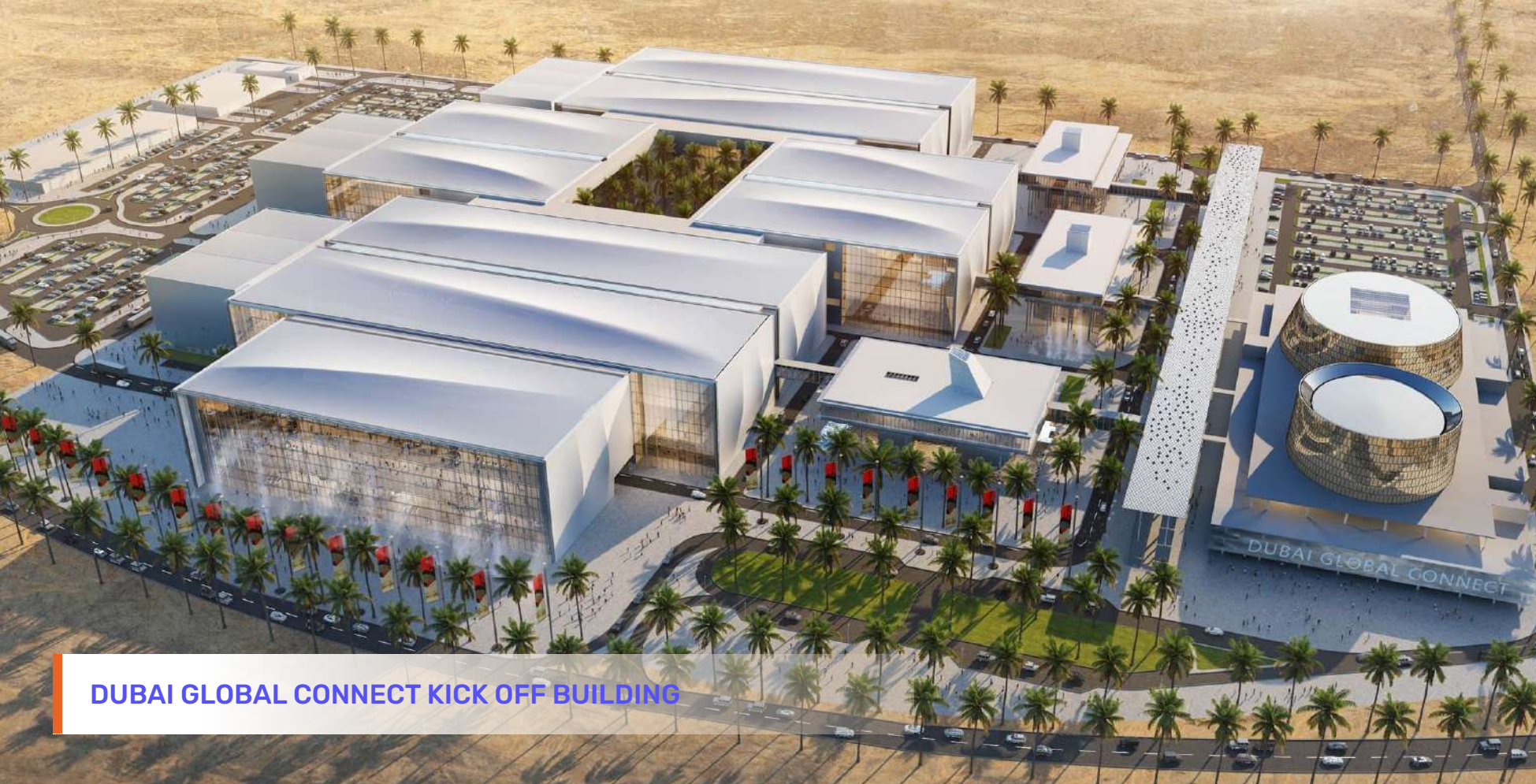
DUBAI GLOBAL CONNECT KICK OFF BUILDING