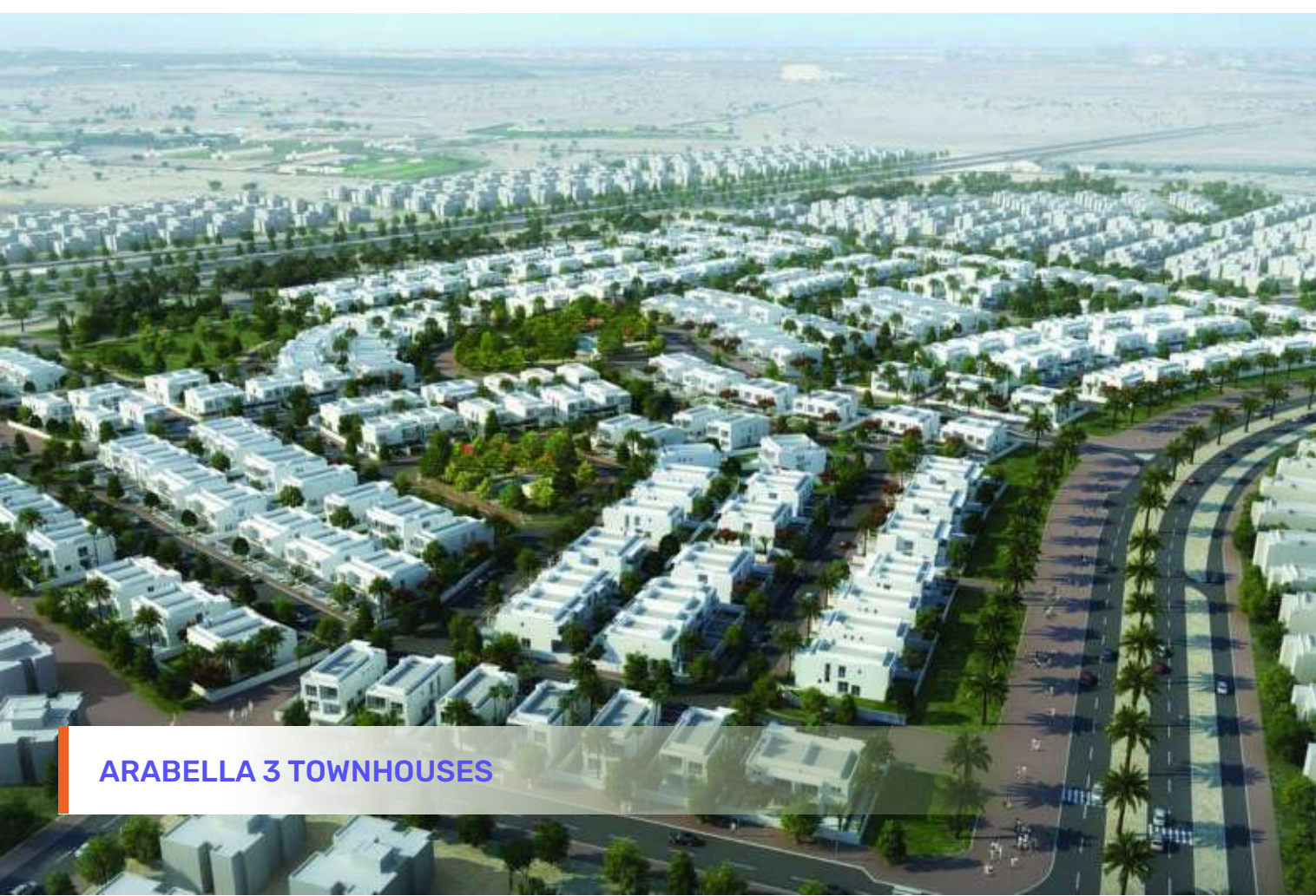
ARABELLA 3 TOWNHOUSES